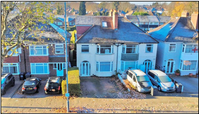
Holly Lane, Erdington, B24 9LA